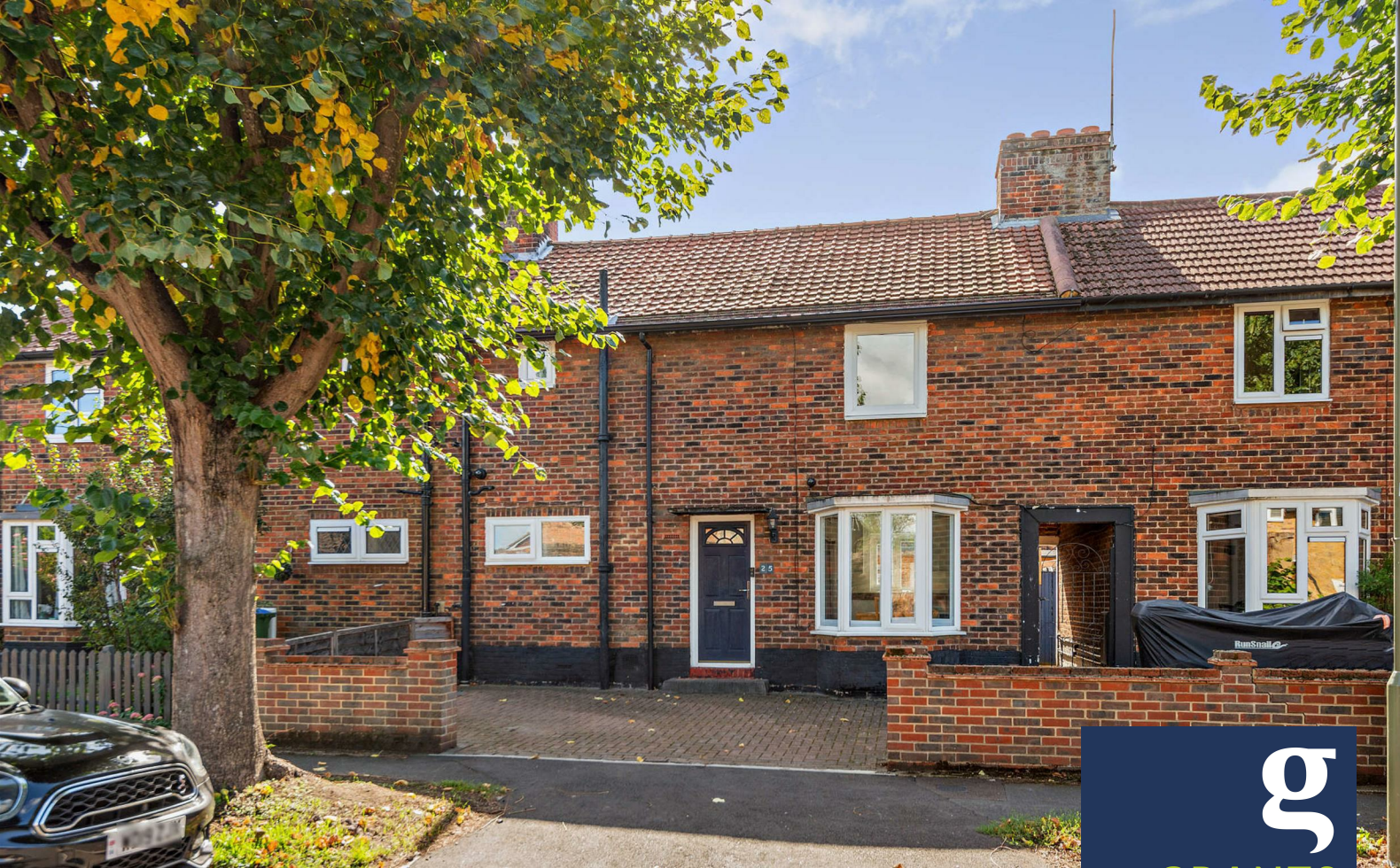
Old Palace Road, Weybridge, KT13 8PH