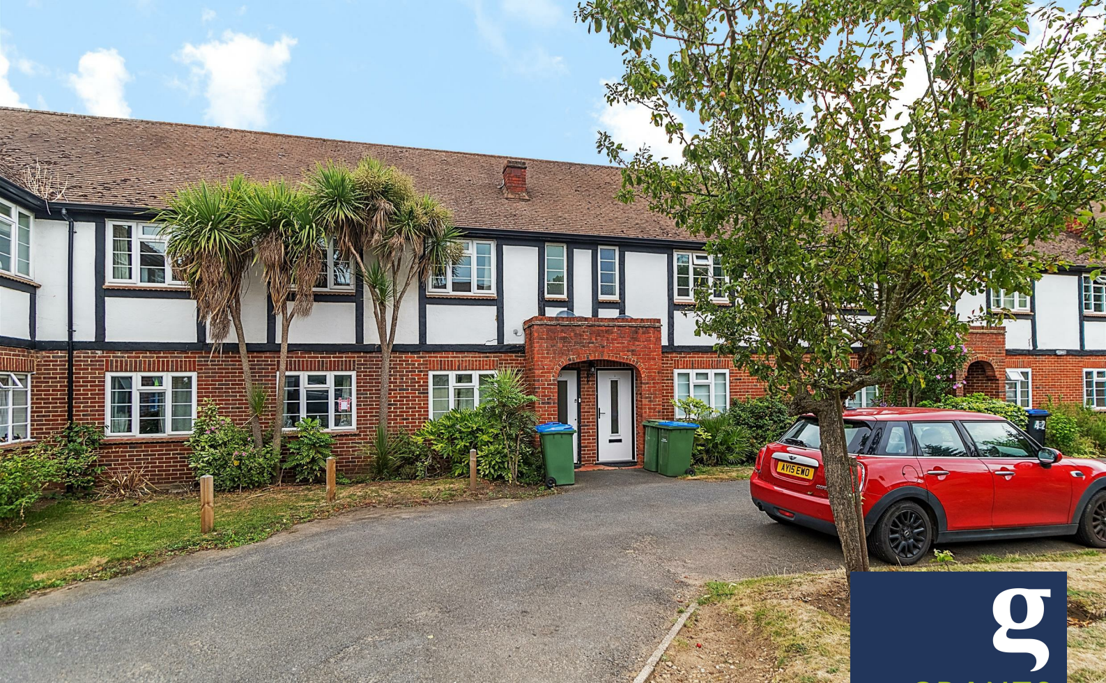
Monument Hill, Weybridge, KT13 8RD