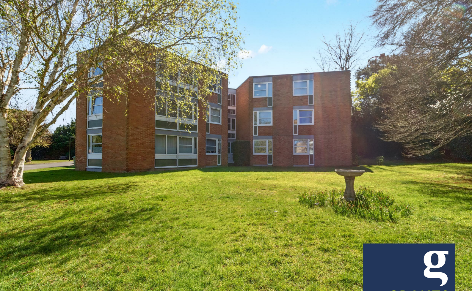
Heathside, Hanger Hill, Weybridge, KT13 9YJ