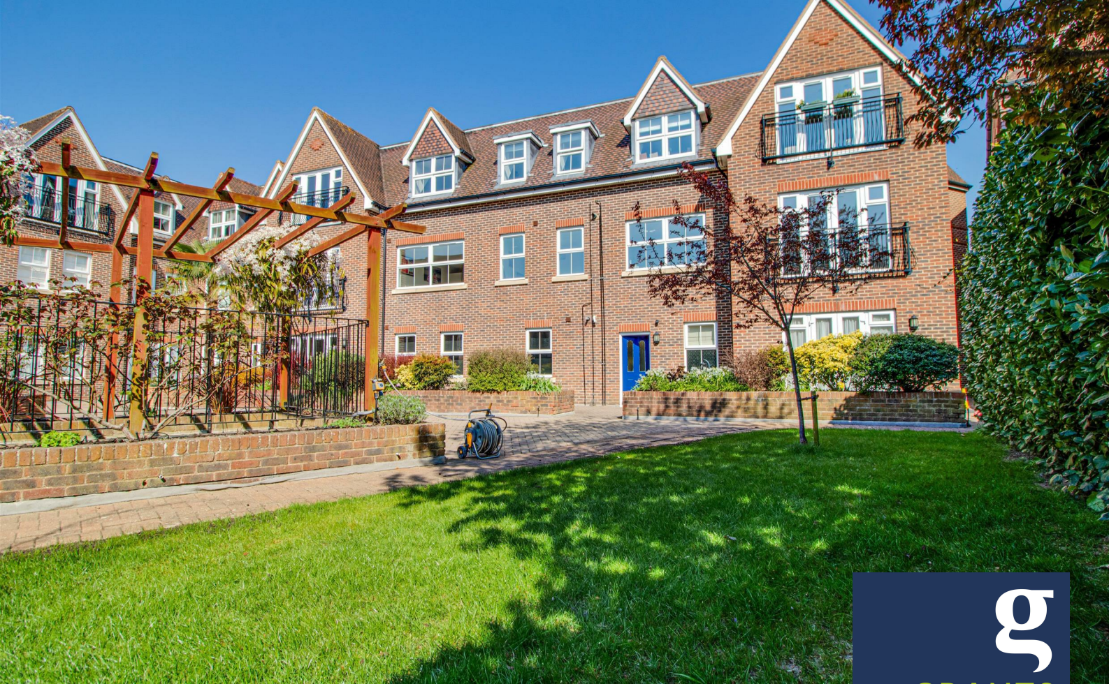
Baker Street, Weybridge, KT13 8BF