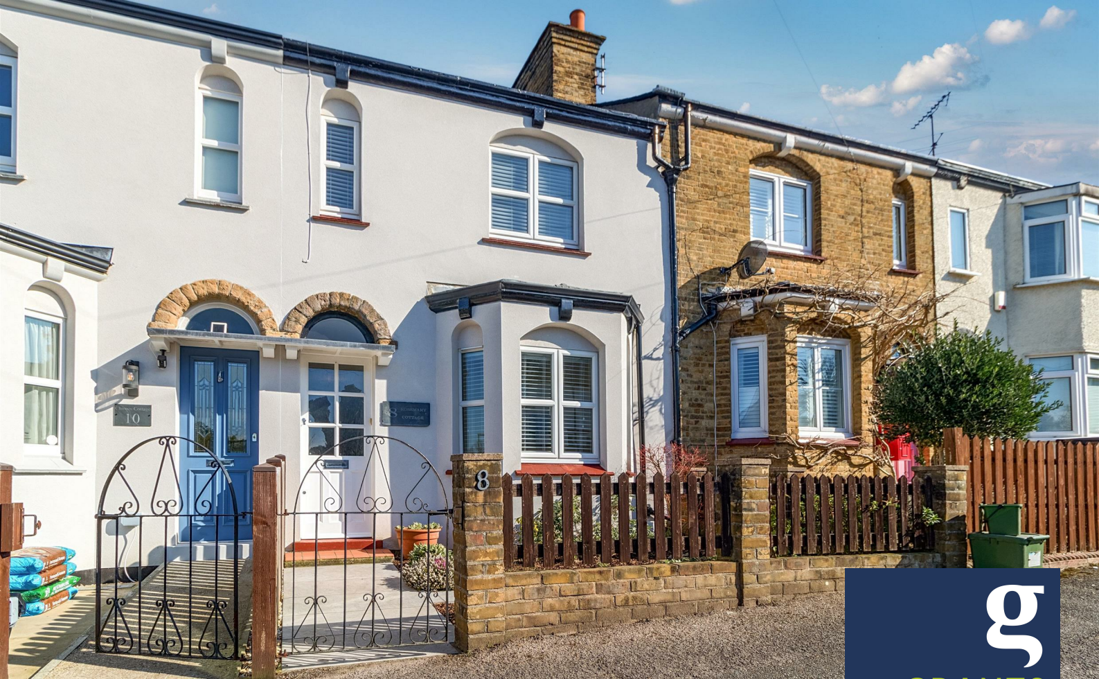
Molyneux Road, Weybridge, KT13 8UR