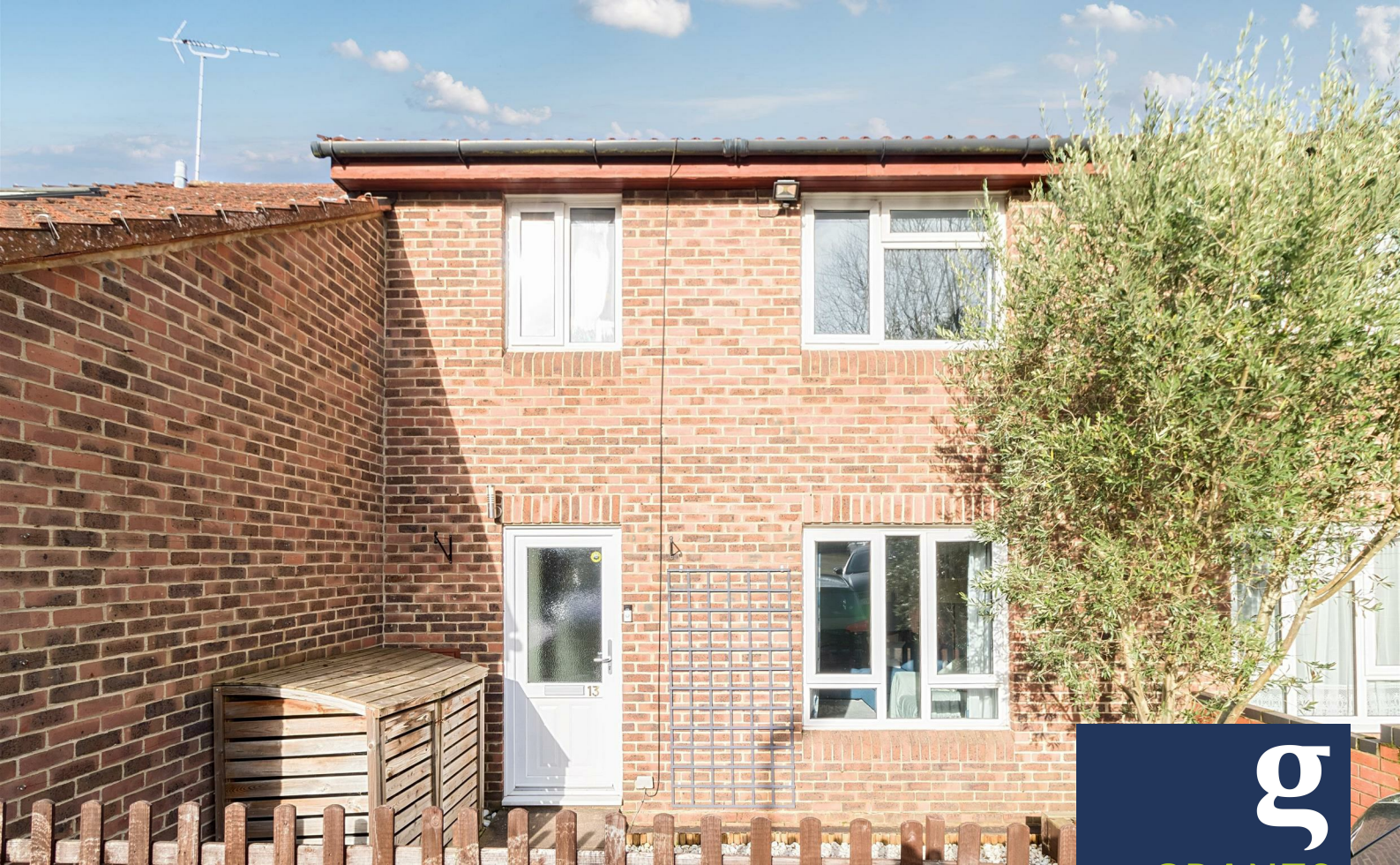
Meadows Leigh Close, Weybridge, KT13 8QD