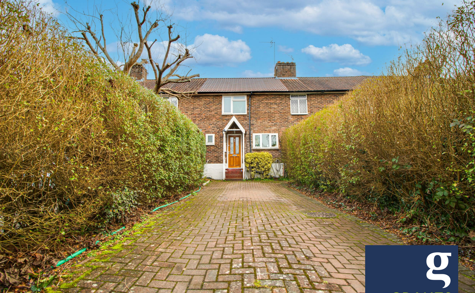
Monument Road, Weybridge, KT13 8QY