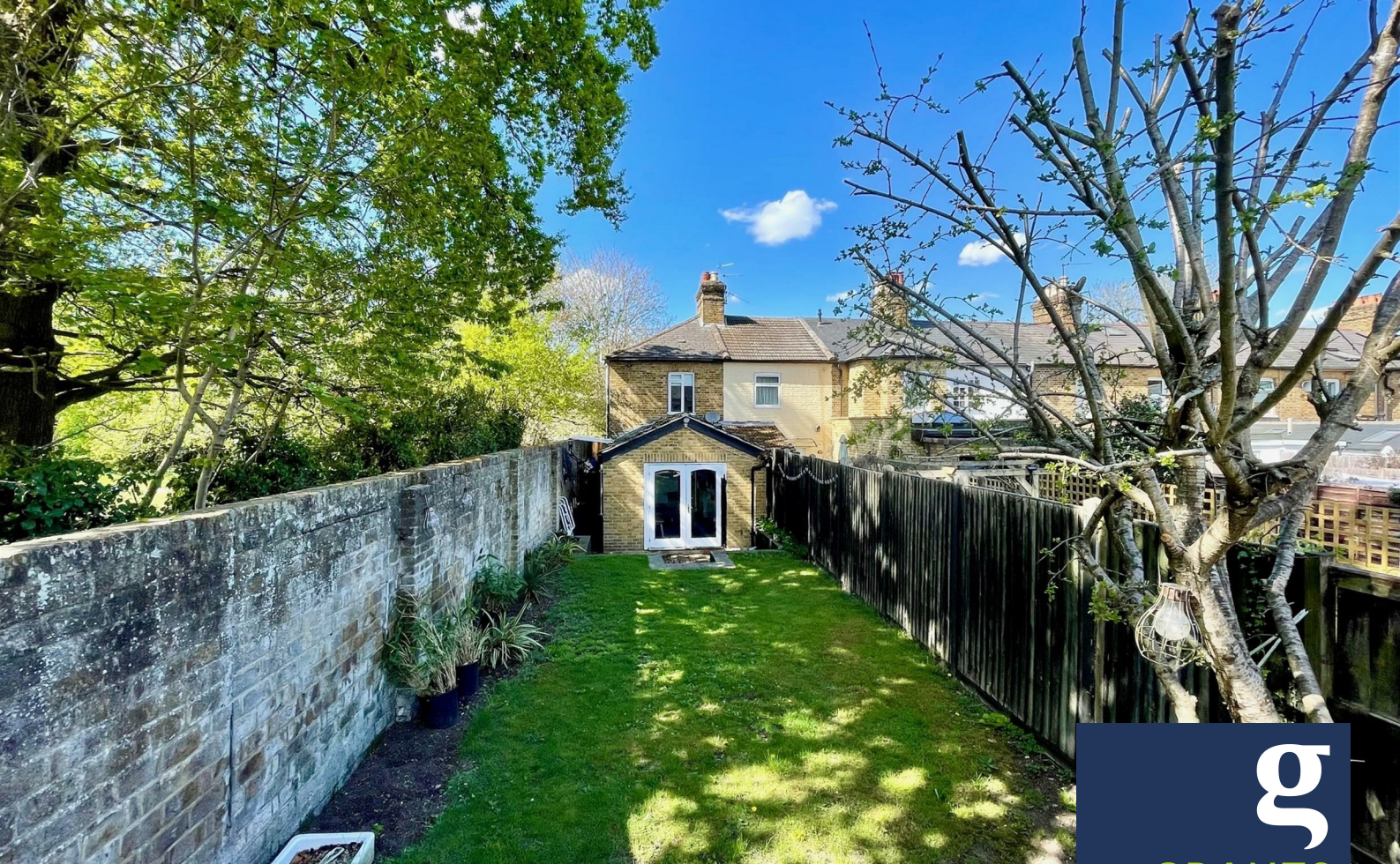
Adelaide Place, Weybridge, KT13 9PU