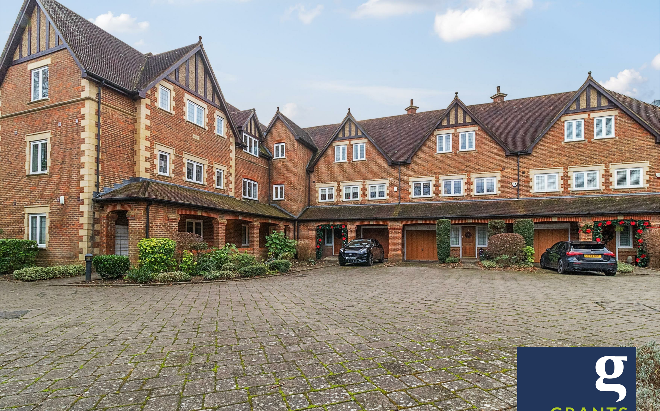
Caenshill House, Chaucer Avenue, Weybridge, KT13 0PB