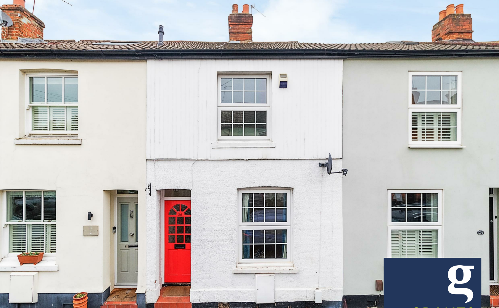
Glencoe Road, Weybridge, KT13 8JY