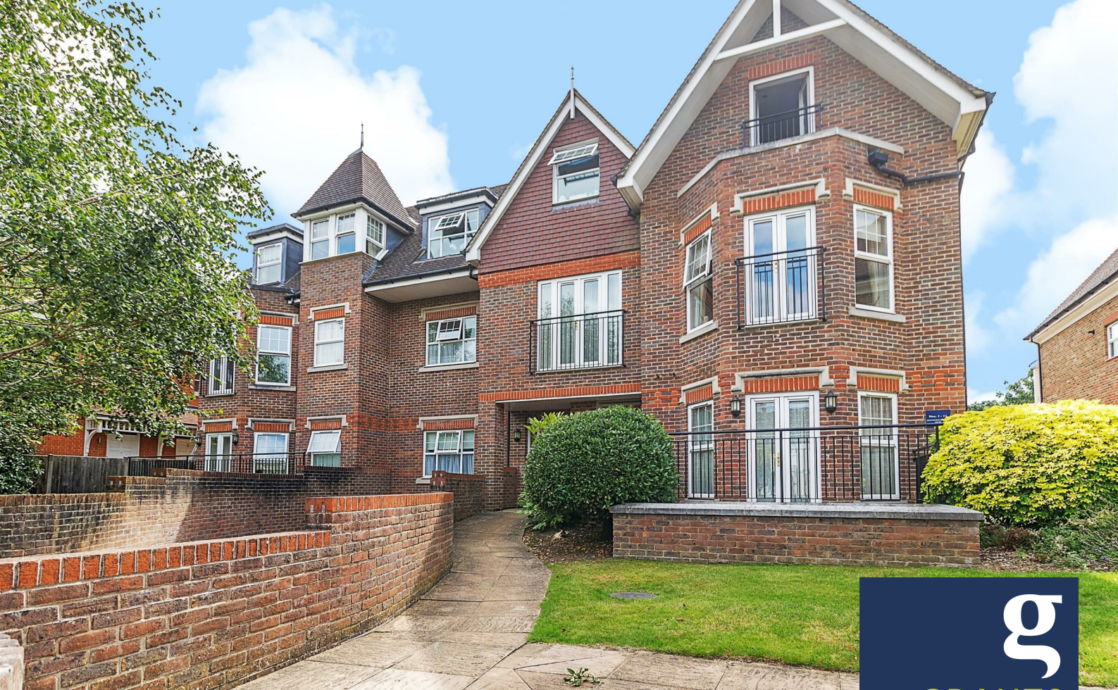
Queensborough House South, Oatlands Chase, Wevbridge. KT13 9SF