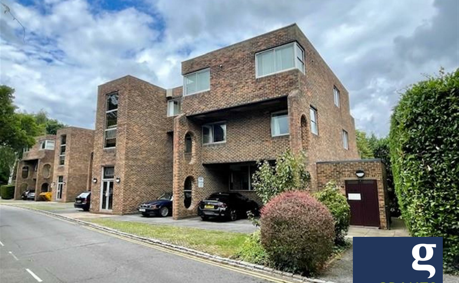
Stroudwater Park, Weybridge, KT13 0DT