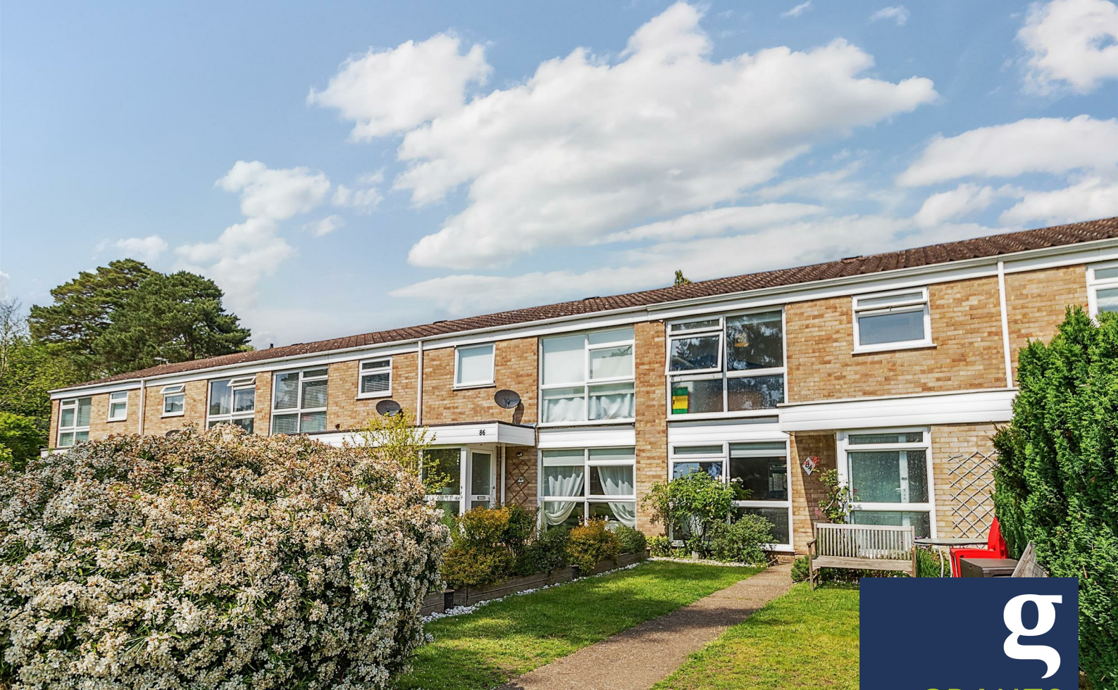
Netherby Park, Weybridge, KT13 0AQ