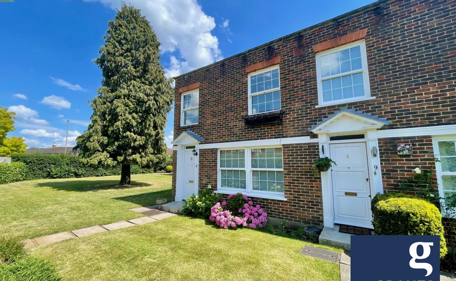
Regency Lodge, Castle Road, Weybridge, KT13 9QR