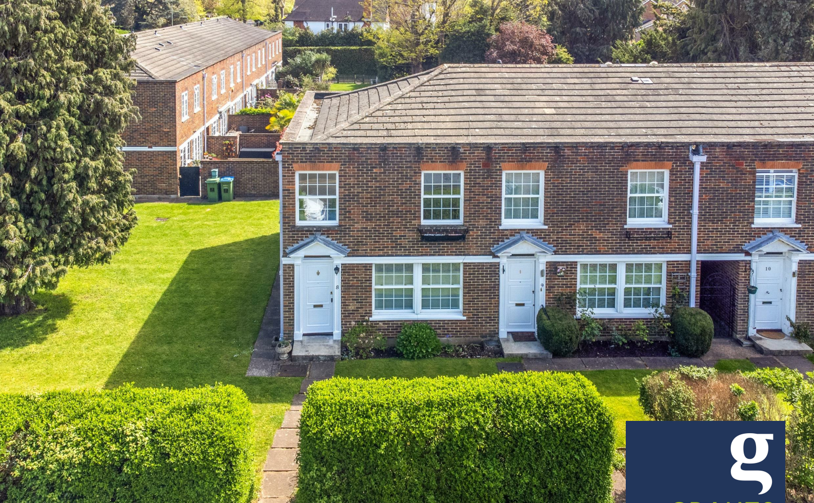
Regency Lodge, Castle Road, Weybridge, KT13 9QR