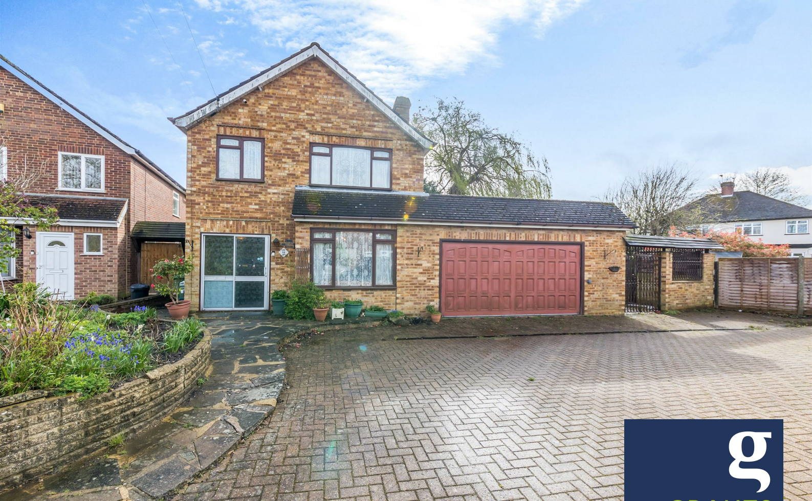
Knightsbridge Crescent, Staines-Upon-Thames, TW18 2OR