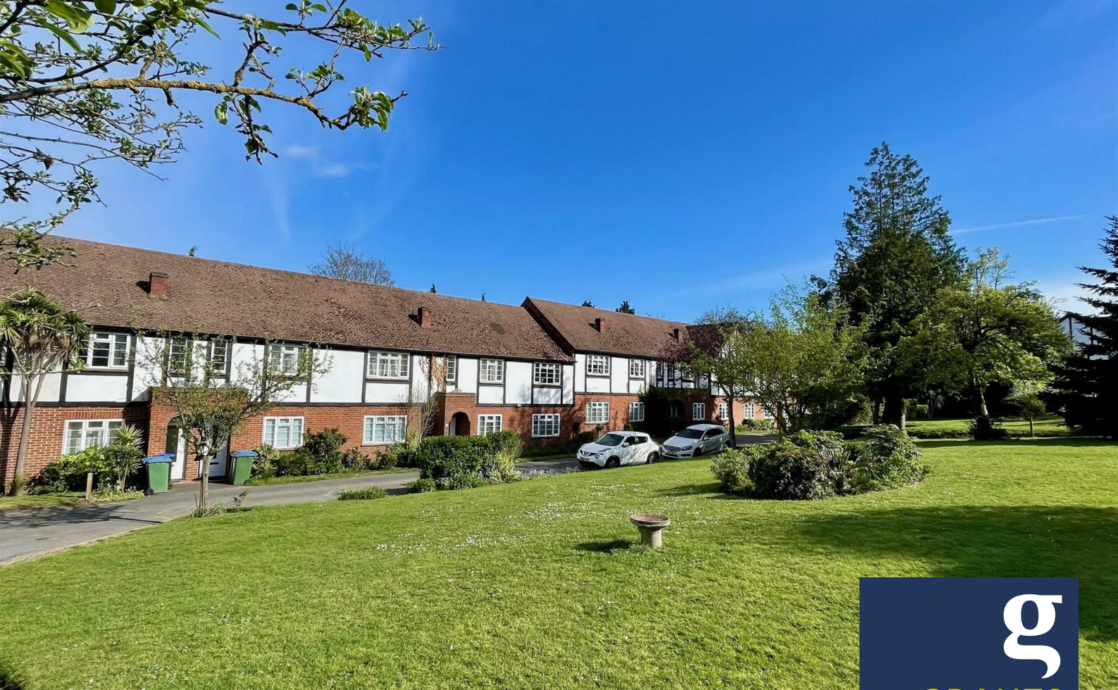
Arlington Lodge, Monument Hill, Weybridge, KT13 8RD