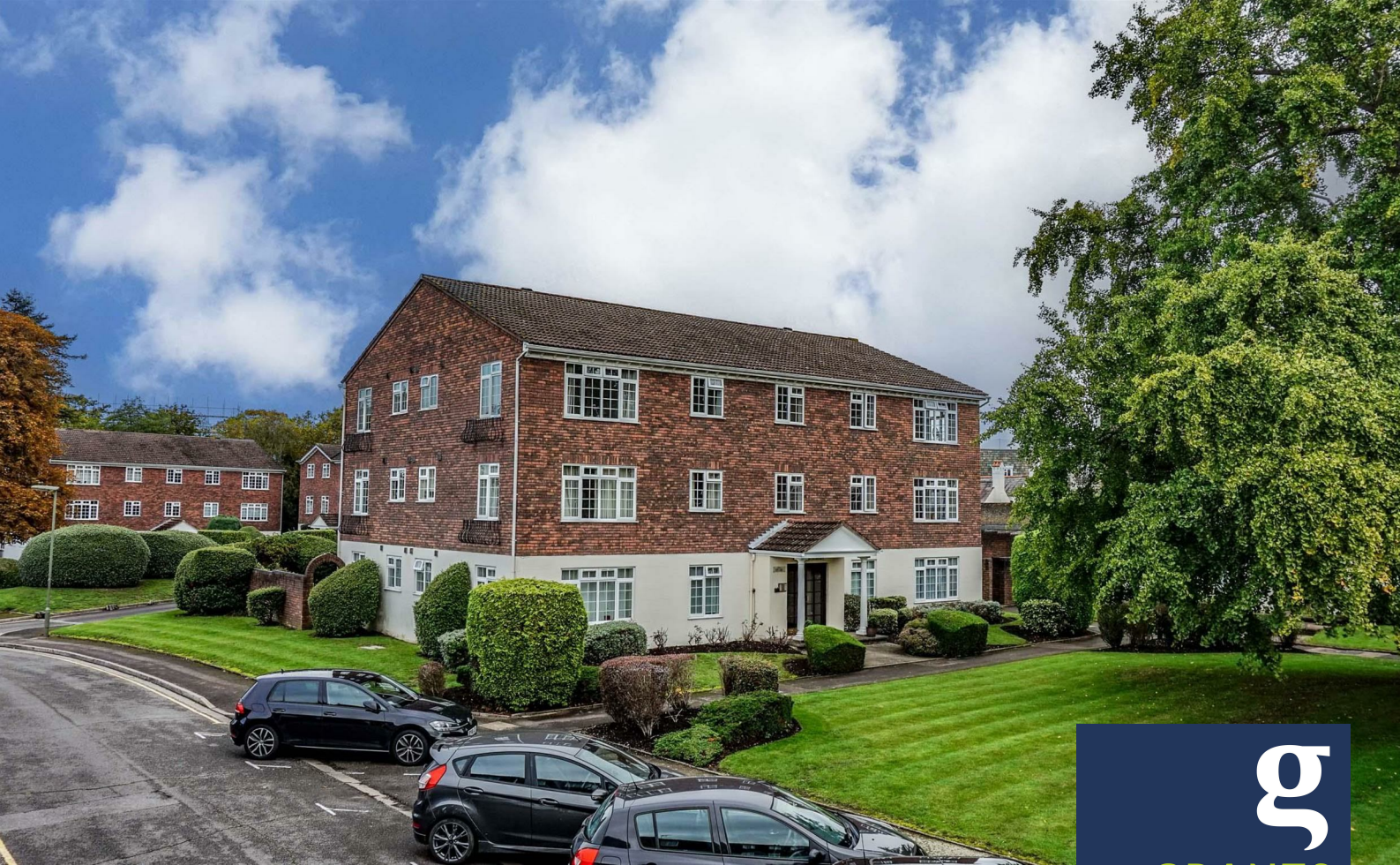
Hillcrest Court, Hillcrest, Weybridge, KT13 8AD