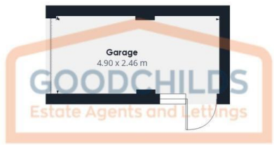
Ground floor Building 2