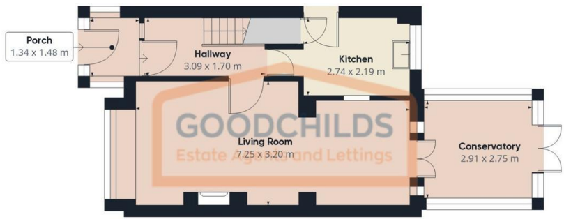
Ground floor Building 1