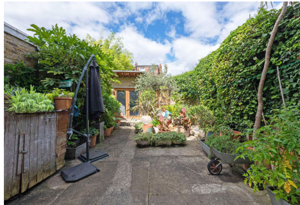
End of Terrace family home in Bedford Park Borders.