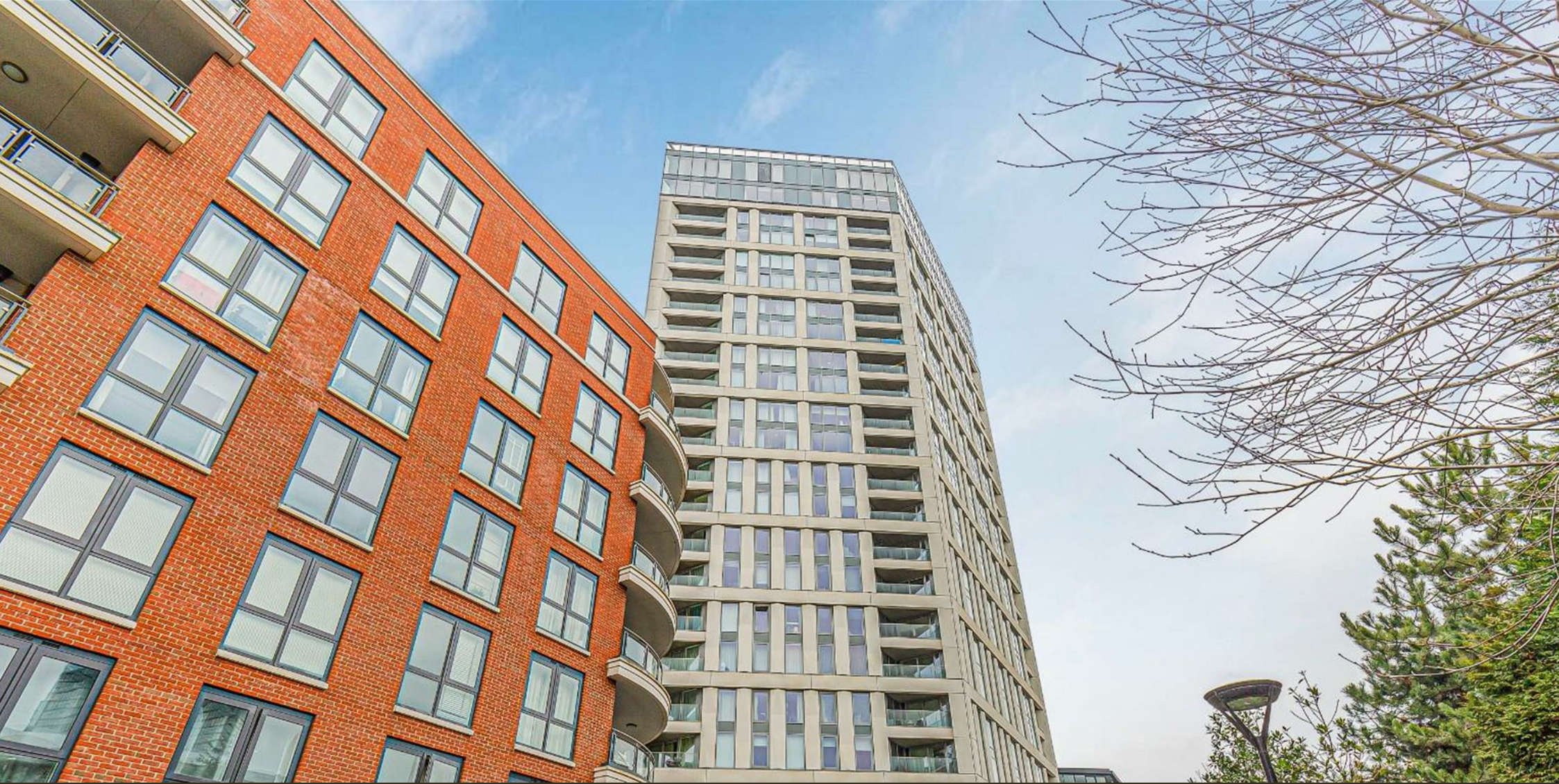
Chelsea Creek Tower, Fulham London SW6