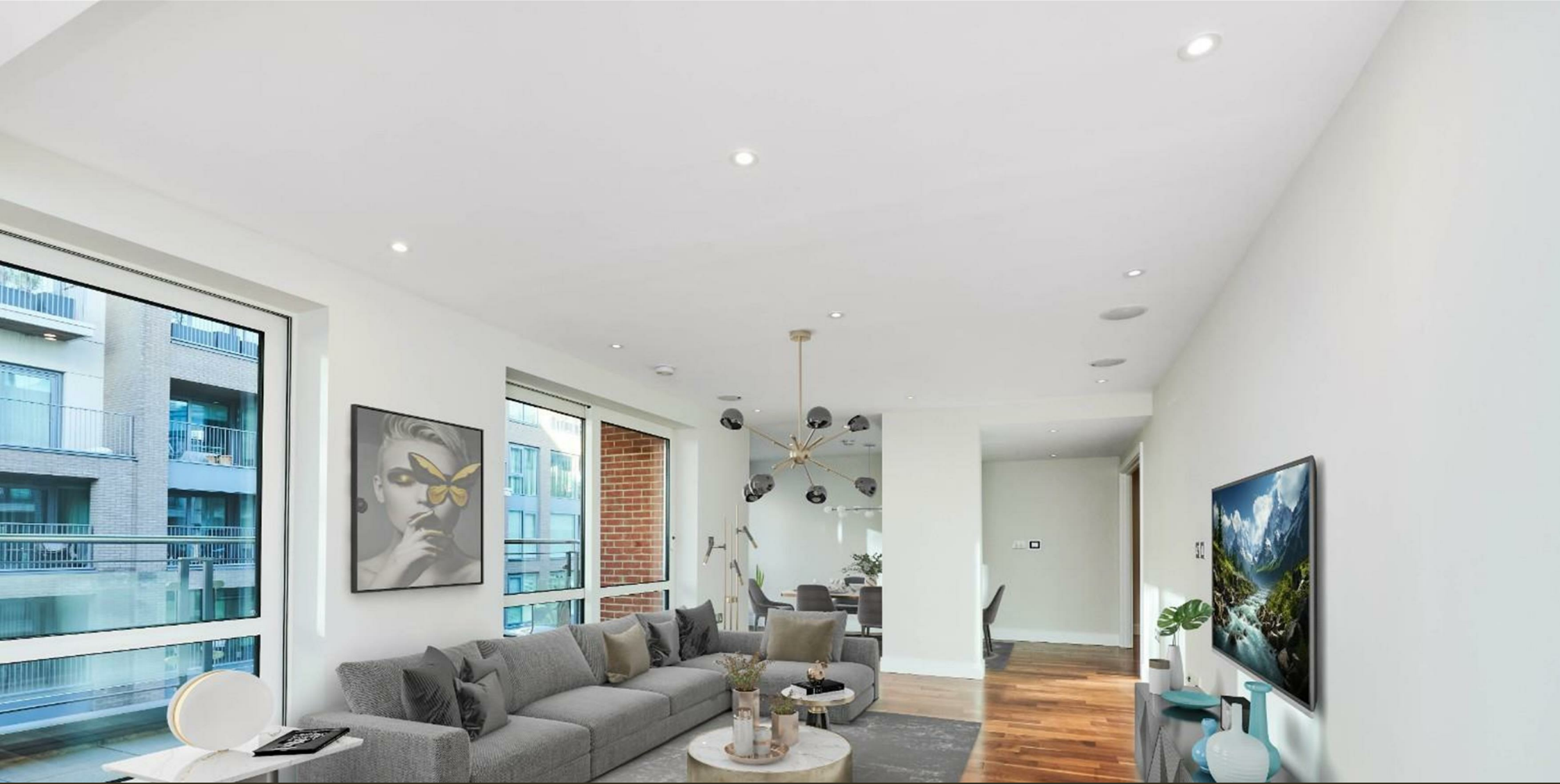
Compass House, Chelsea Creek London SW6