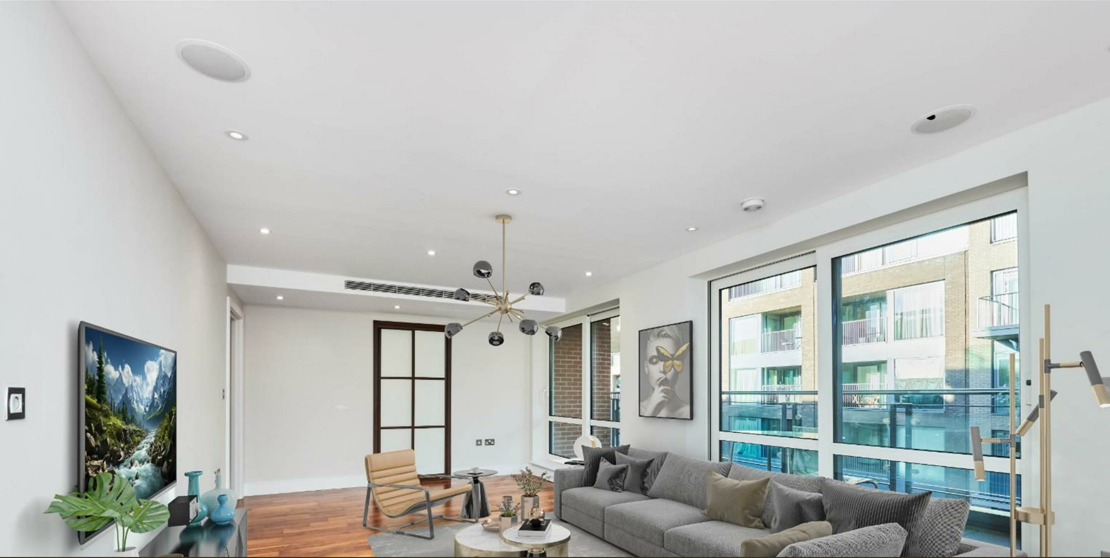
Compass House, Chelsea Creek London SW6