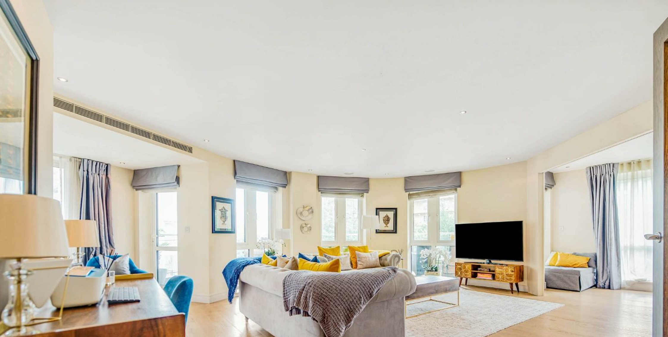
Doulton House, Chelsea Creek Fulham SW6