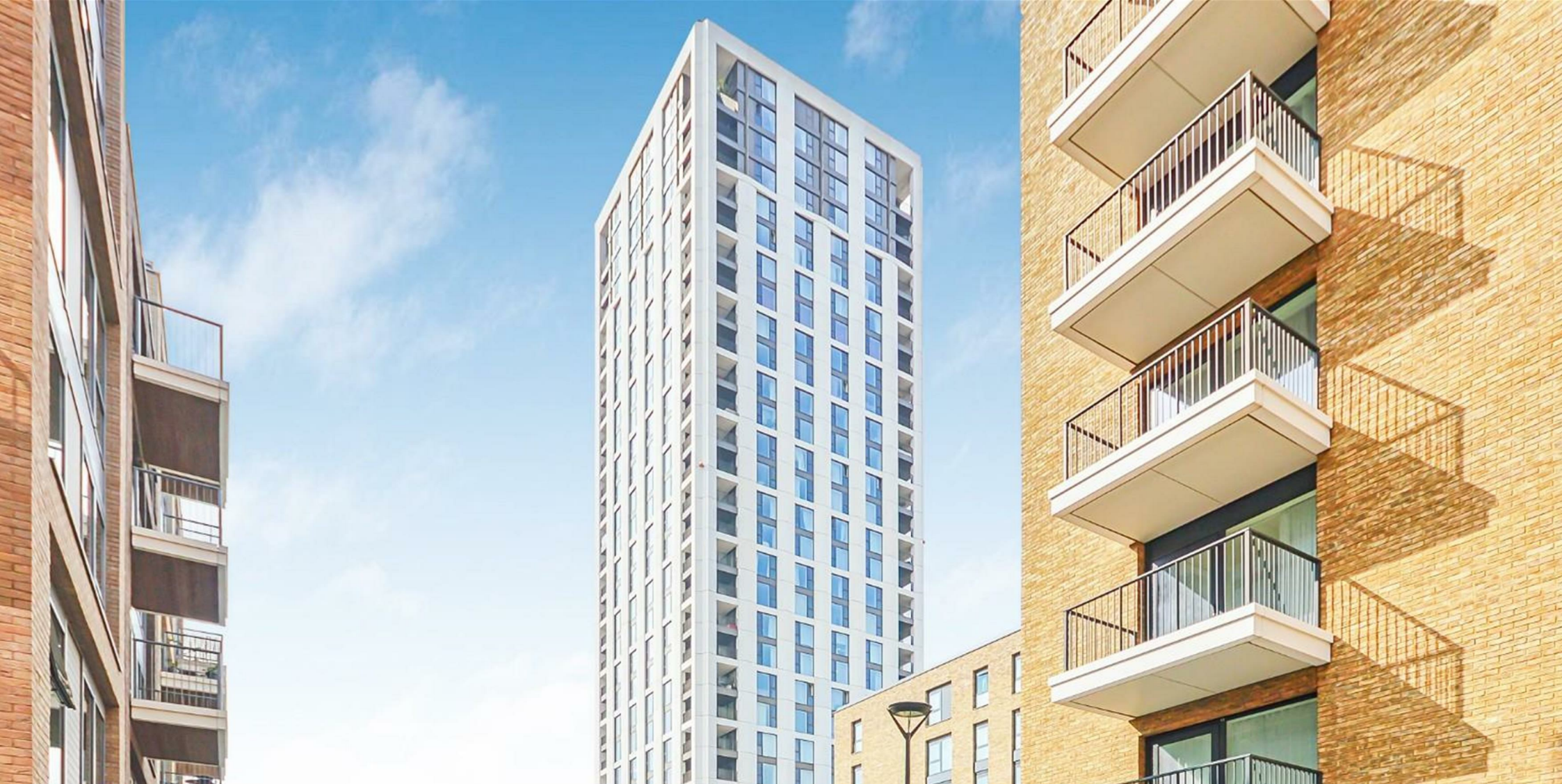
Kings Tower, Chelsea Creek Fulham SW6