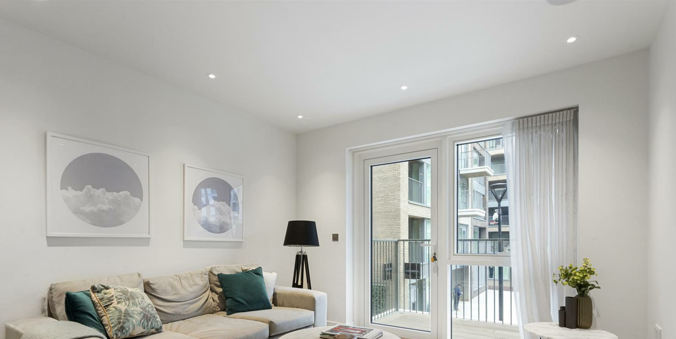
Lockside House, Chelsea Creek London SW6