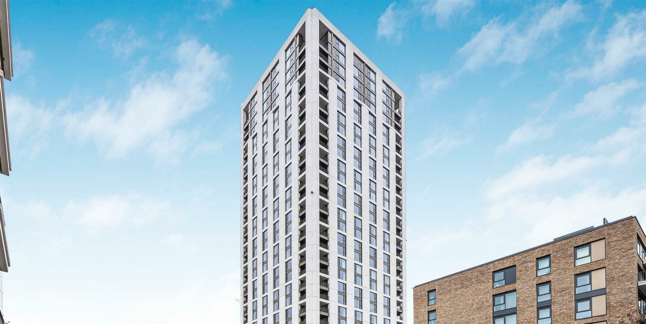
Kings Tower, Chelsea Creek London SW6