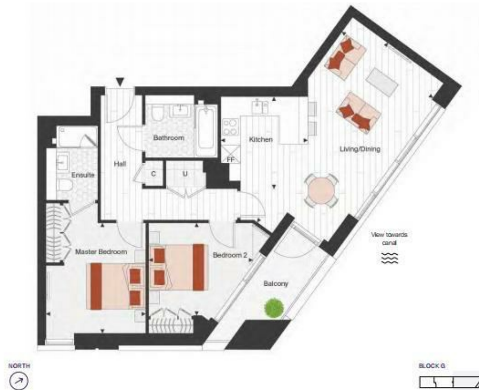
G1 - SECOND FLOOR

SECOND, THIRD, FOURTH, FIFTH AND SIXTH FLOORS APARTMENTS 988, 998, 1008, 1018 & 1028