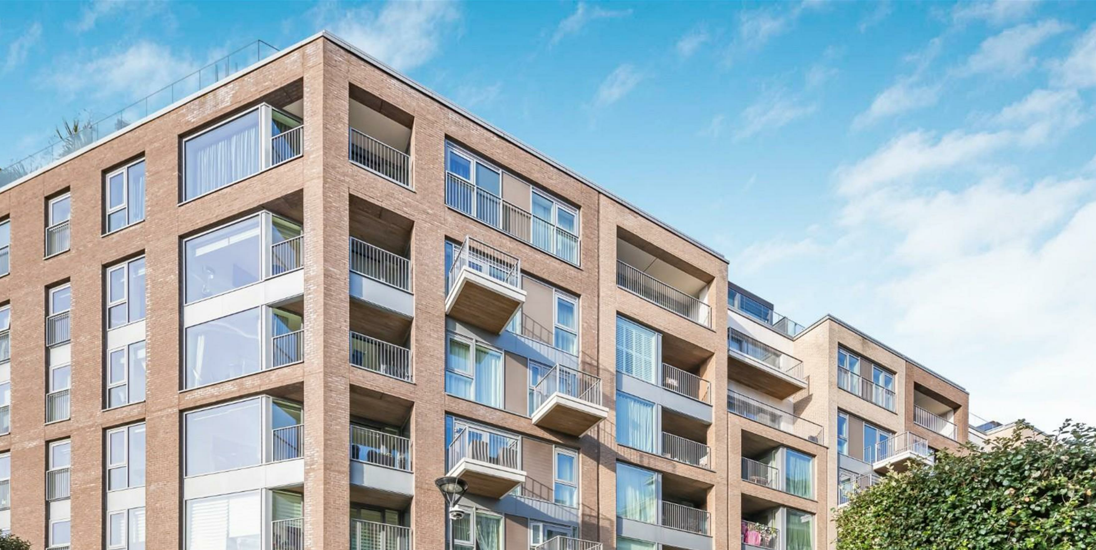
Dockside House, Chelsea Creek Fulham SW6