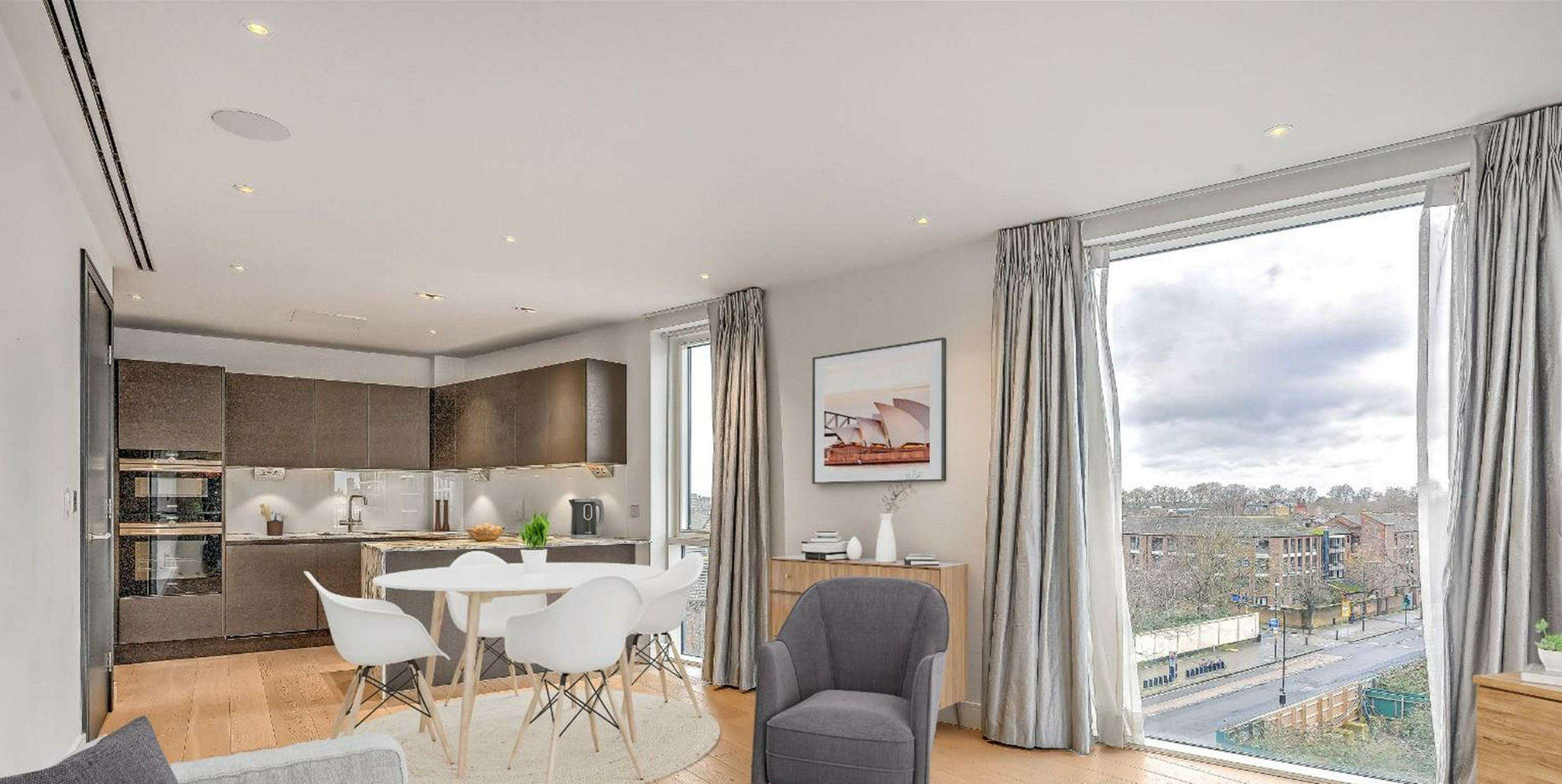
Lockside House, Chelsea Creek Fulham SW6