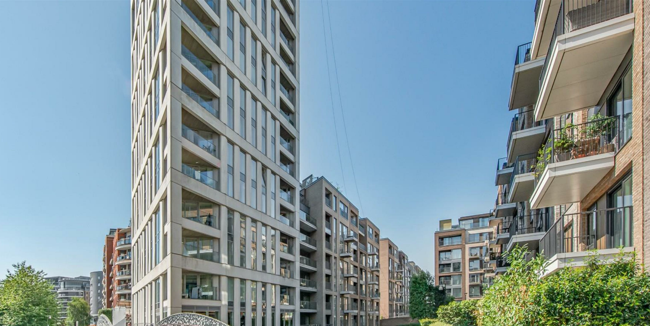
Chelsea Creek Tower, Chelsea Creek Fulham SW6