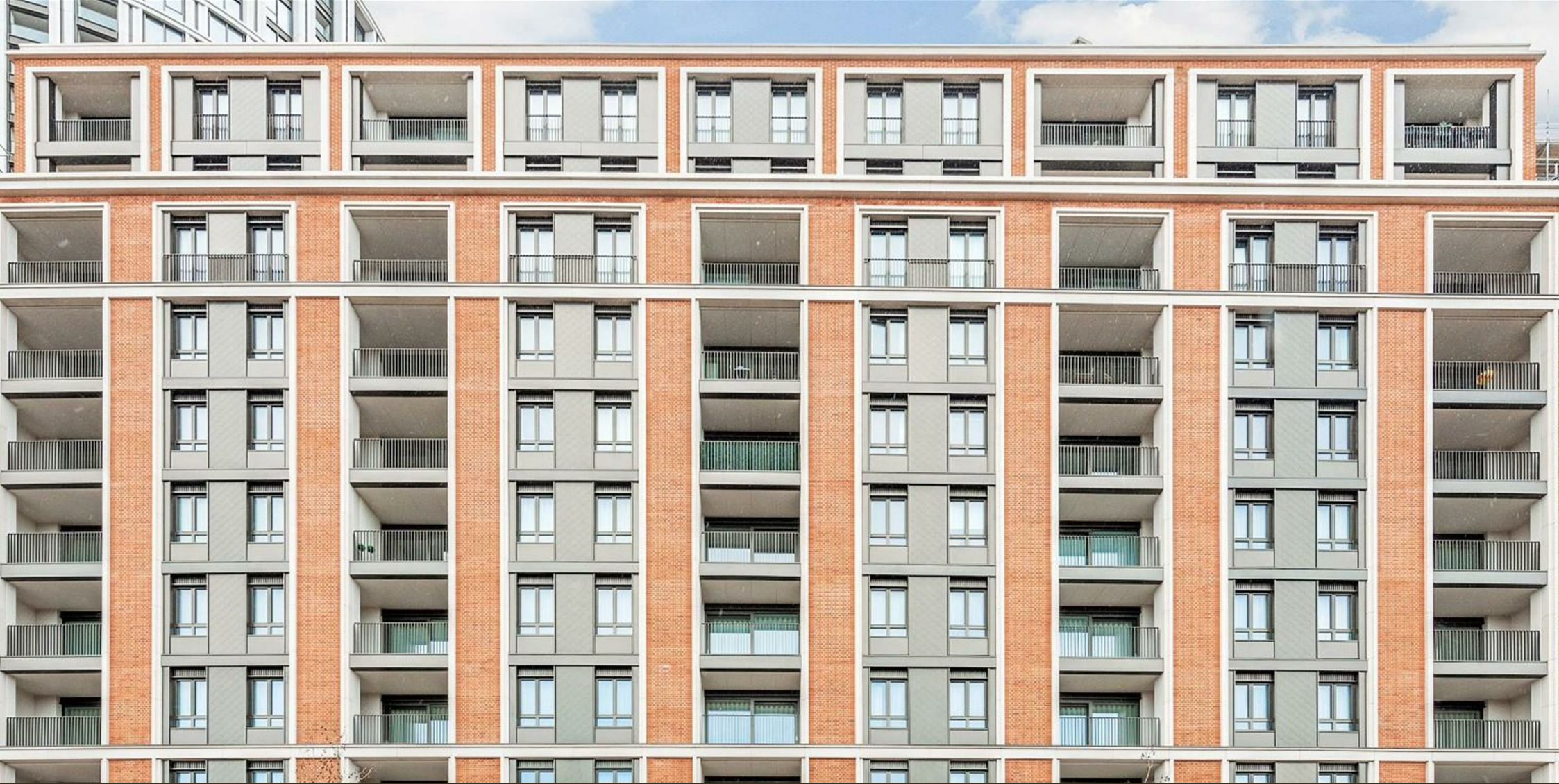
Garrett Mansions, Edgware Road London W2