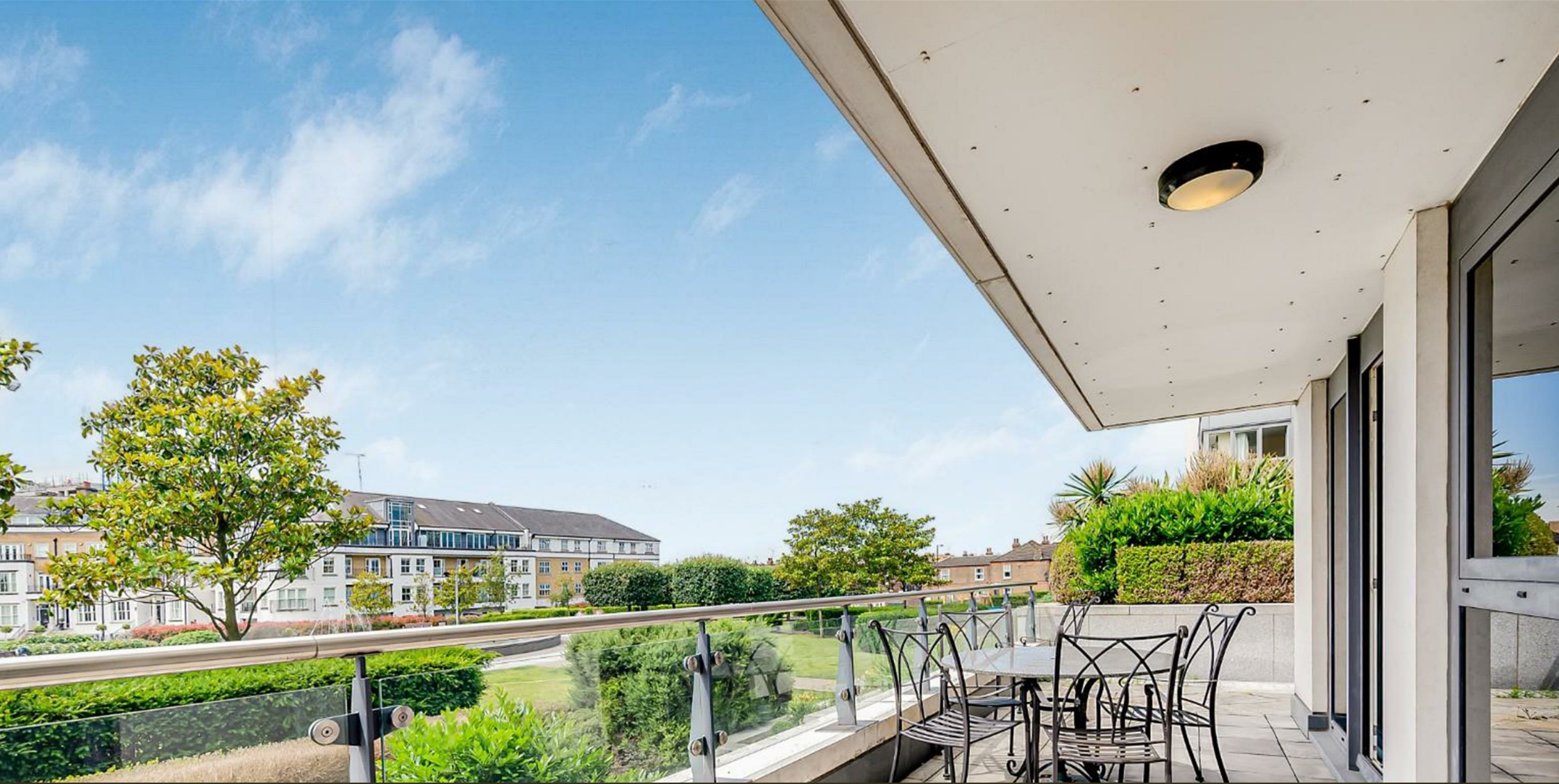
Box Tree House, Imperial Wharf London SW6