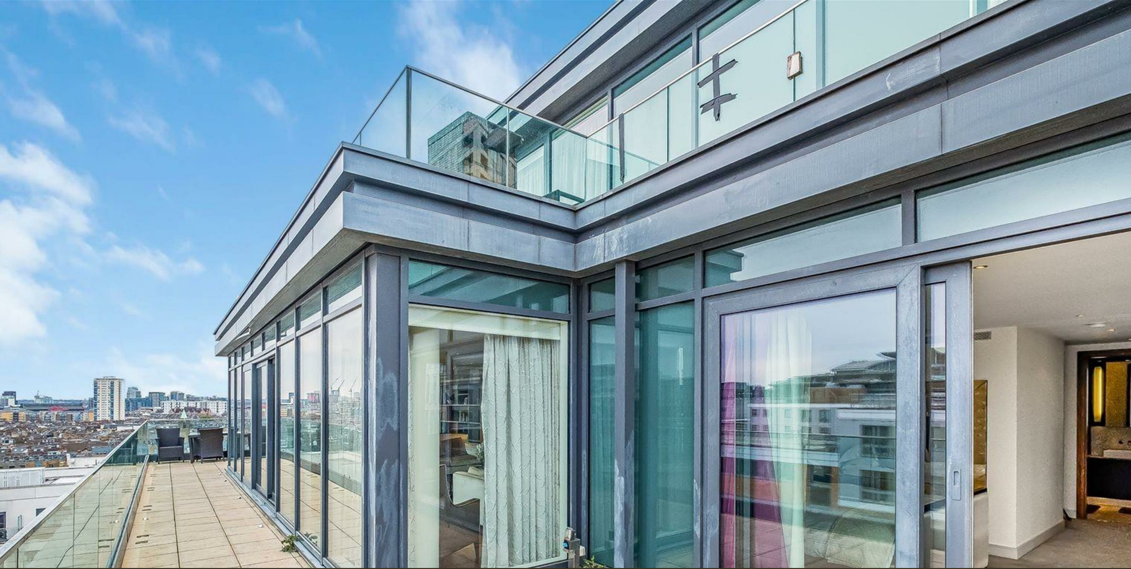
Compass House, Chelsea Creek London SW6