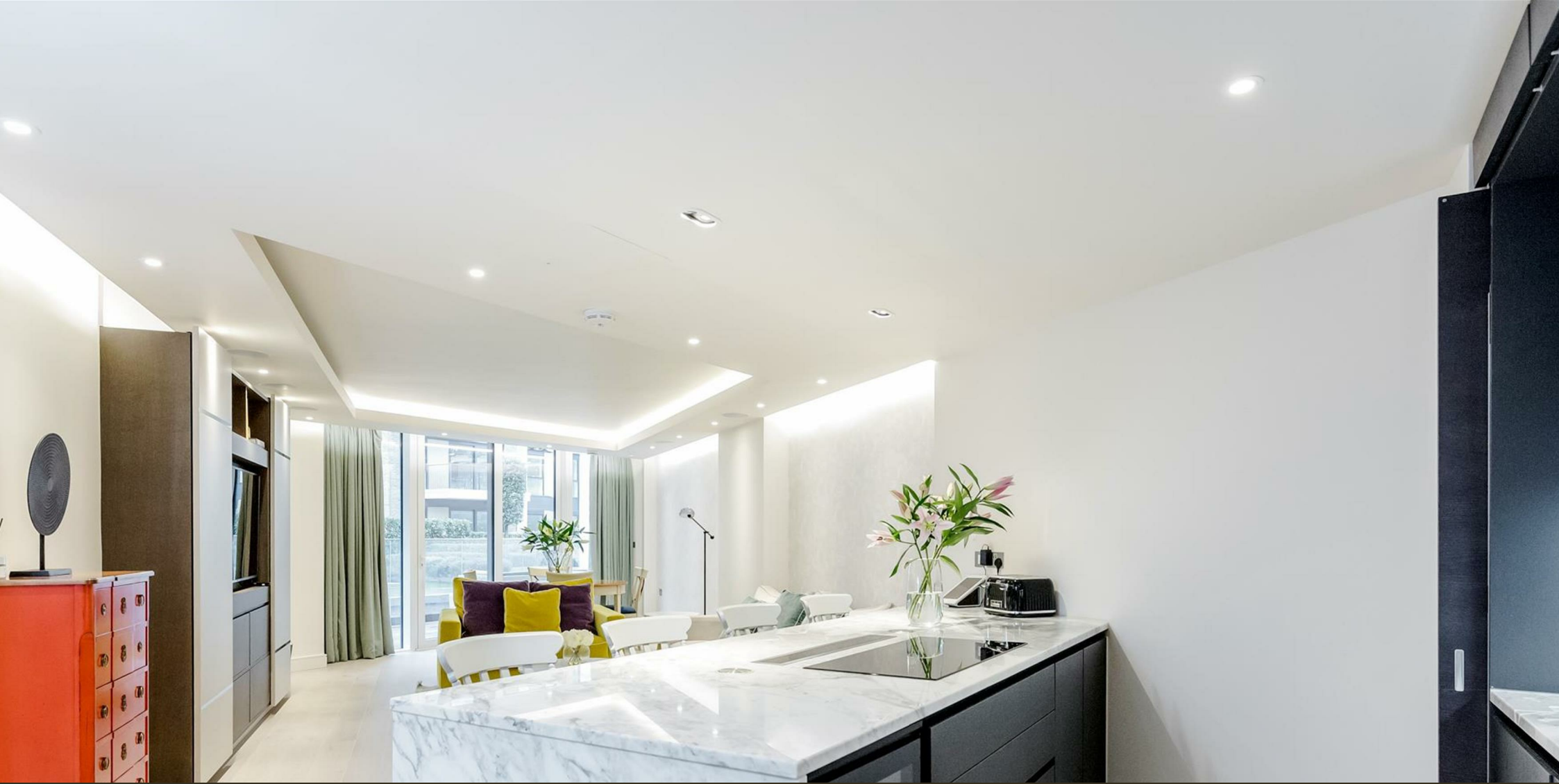
Countess House, Chelsea Creek Fulham SW6