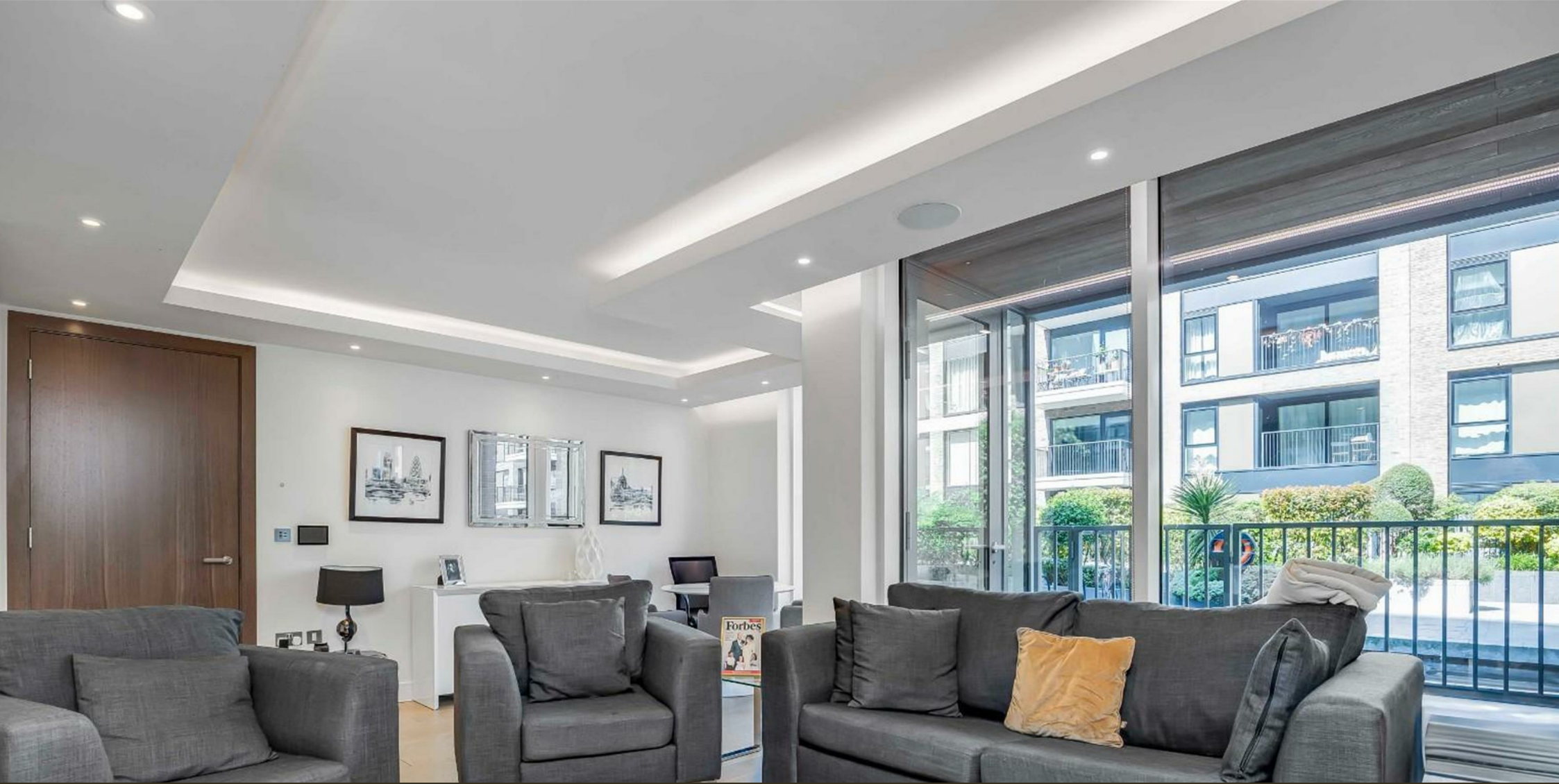
Countess House, Chelsea Creek Fulham SW6