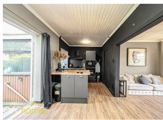
30 Bolton Old Road, Atherton, M46 9DL