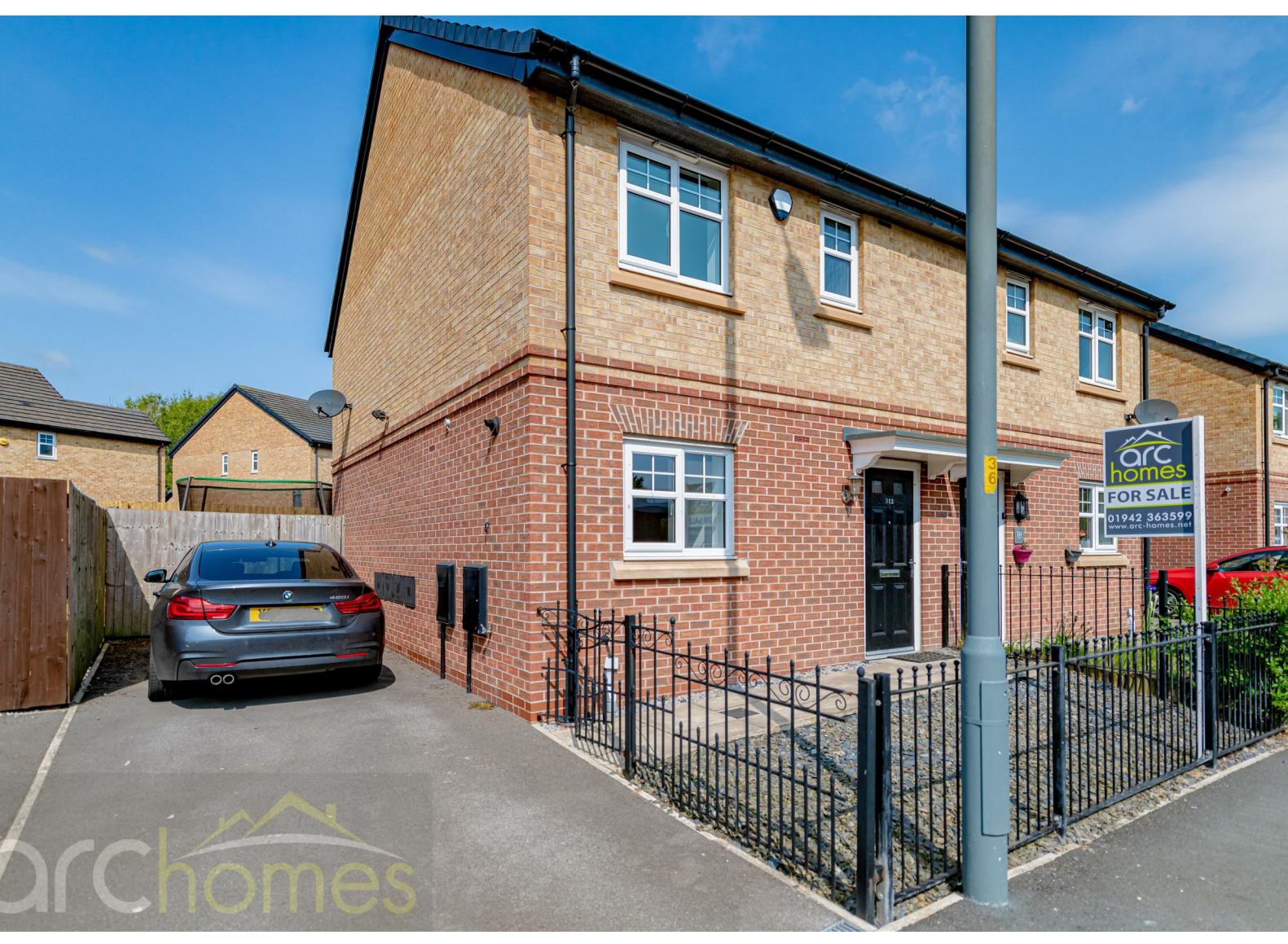
312 North Road, Atherton, M46 ORF £1,100

ARC HOMES are delighted to offer TO LET this stunning three bedroom semi detached situated on the very popular Cottonfields Development in Atherton. Entry is via an entrance hallway which provides access to a handy downstairs cloakroom. The modern fitted kitchen dining is finished with high gloss units. The well proportioned sitting room sits to the rear and boasts French doors which combine indoor and outdoor living space. To the first floor are three generous bedrooms and a modern bathroom. Outside, the generous front gardens are laid to lawn with a double driveway. The enclosed rear gardens are laid to lawn and offer generous outdoor space. The property is available immediately and is offered UNFURNISHED.