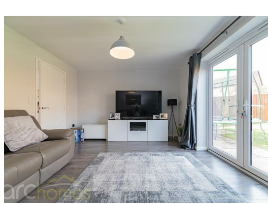
30 Bolton Old Road, Atherton, M46 9DL