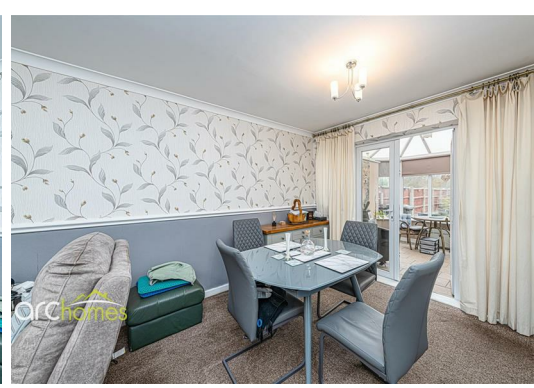
30 Bolton Old Road, Atherton, M46 9DL