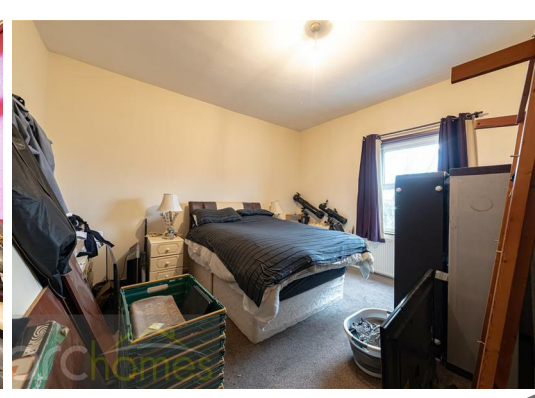
30 Bolton Old Road, Atherton, M46 9DL