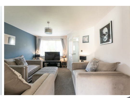
30 Bolton Old Road, Atherton, M46 9DL