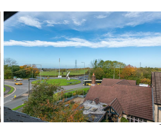
30 Bolton Old Road, Atherton, M46 9DL