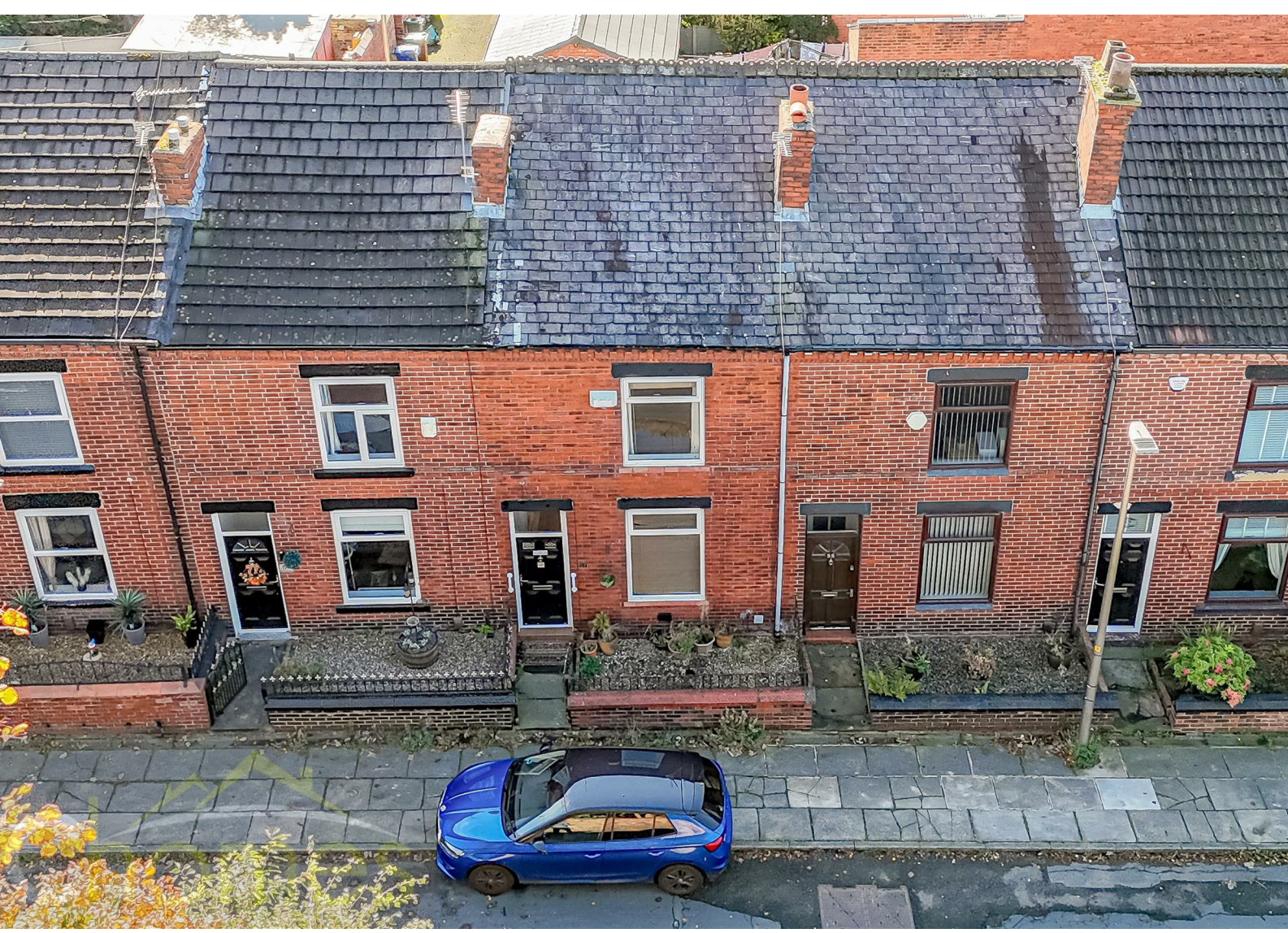
53 St. Georges Street, Tyldesley, M29 8HY Offers over £130,000

ARC HOMES are delighted to offer FOR SALE this excellent garden fronted terraced property positioned within a very sought after location. This excellent home is conveniently located within close proximity of Tyldesley Town Centre and sought after schools. With no onward chain, this property would be ideal for a range of buyers and early viewing is highly advised. Entry is via an entrance vestibule which leads into a well proportioned sitting room. To the rear sits the kitchen dining room. To the first floor are two excellent double bedrooms and a bathroom. Outside, there are enclosed gardens to both front and rear.