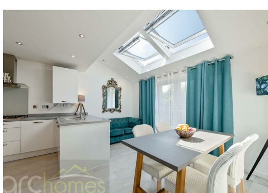
30 Bolton Old Road, Atherton, M46 9DL