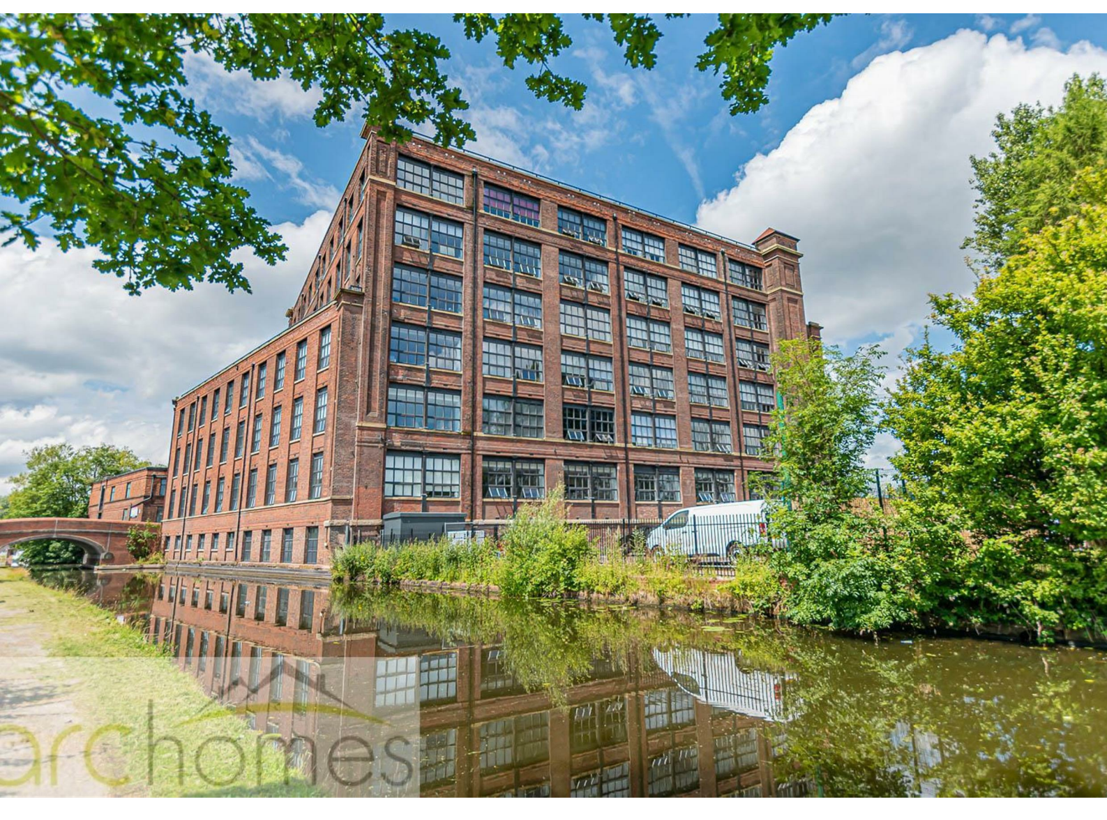
68 Mather Lane, WN7 2FS £1,100

ARC HOMES are delighted to offer TO LET, this absolutely amazing apartment boasting generous accommodation together with simply stunning views as far as the eye can see. Mather Lane mill is an 1882 grade II listed building which has been flawlessly converted to create modern contemporary loft style apartments. The new tenants of this gorgeous apartment will take advantage of the communal services including concierge service, fully equipped gymnasium, lobbies, dining rooms and an awesome cinema room.