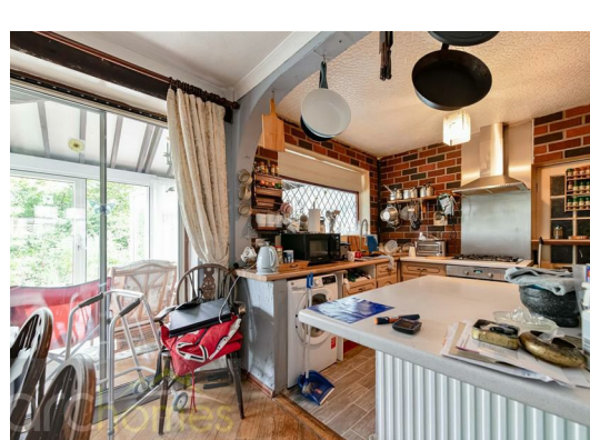
30 Bolton Old Road, Atherton, M46 9DL