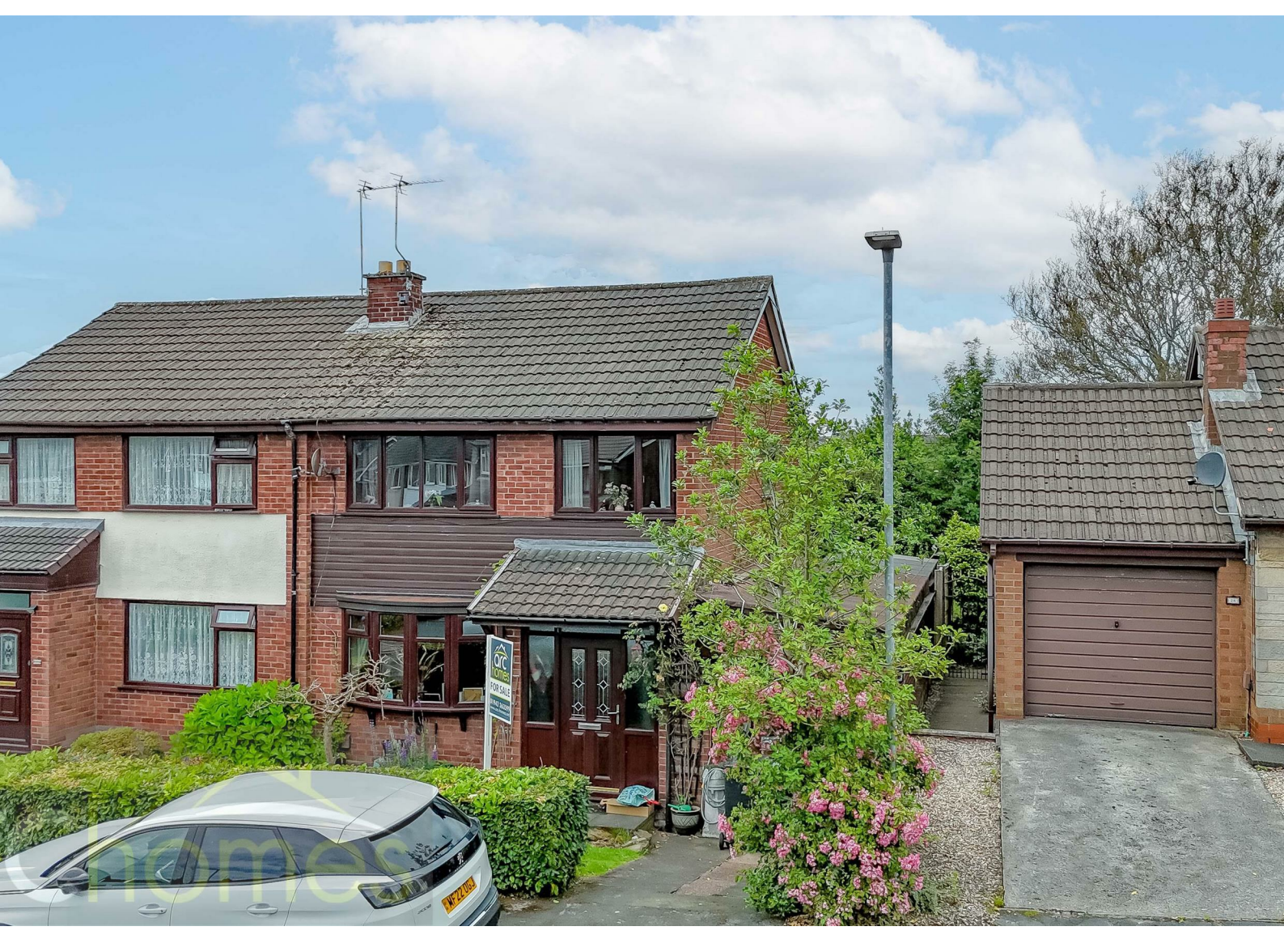
24 Ling Drive, Atherton, M46 9BH £220,000

ARC HOMES are delighted to offer FOR SALE this fantastic extended three bedroom semi detached property positioned within a very sought after cul de sac and within convenient close proximity of Atherton V2. This well presented home offers generous accommodation including two reception rooms, & a conservatory to the rear. Three bedrooms, ample parking and lovely rear gardens. Entry is via an entrance hallway which provides access into a well proportioned sitting room. To the rear sits a fitted kictchen and dining room which leads in to the conservatory with French doors opening into the rear garden. To the first floor are three generous bedrooms and a family bathroom. The converted garage offers an extra reception room / fourth bedrooms. Outside, the front garden with driveway providing off road parking. The enclosed rear gardens has a range of mature shrubs and trees that offer a degree of privacy.