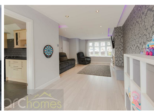
30 Bolton Old Road, Atherton, M46 9DL