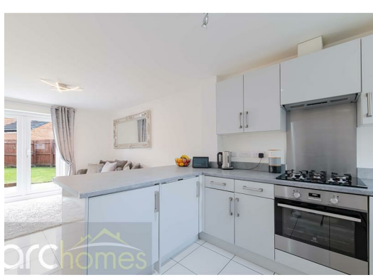
30 Bolton Old Road, Atherton, M46 9DL