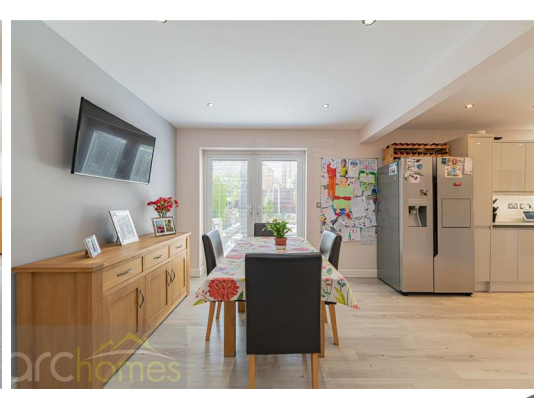
30 Bolton Old Road, Atherton, M46 9DL